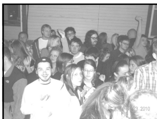
God Dogs & Jesus Burgers

Whether through serving “God Dogs” and “Jesus Burgers” at 3 a.m., serving coffee and donuts to students studying for finals, providing a “free” carwash, or washing hurting feet of dancers at a dance marathon raising money for charity, students are learning to share the love of God through serving. While many of those being served don’t comprehend the “why’s”, it provides many opportunities for spiritual conversation.