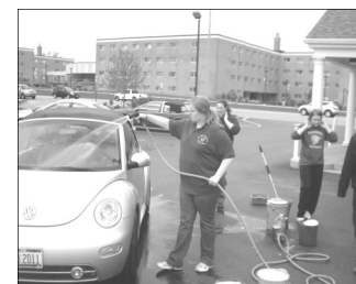
“Free” Car Wash